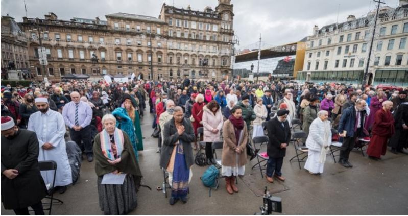
"31 October 2021, Glasgow, Scotland, United Kingdom: Interfaith vigil held at George Square on the opening day of the united nations climate change conference COP26 in Glasgow. The vigil gathered representatives from a wide range of religions as well as people of no faith to collective pray for all those working for COP26 to be a successful meeting in mitigating what will otherwise be further development towards a climate disaster.

The religious leaders shared a joint statement urging governments to put the Paris accord into action."